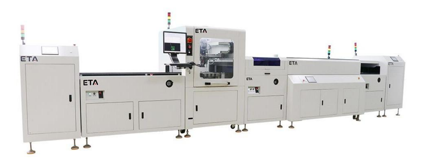
PCBA Coating Machine T550